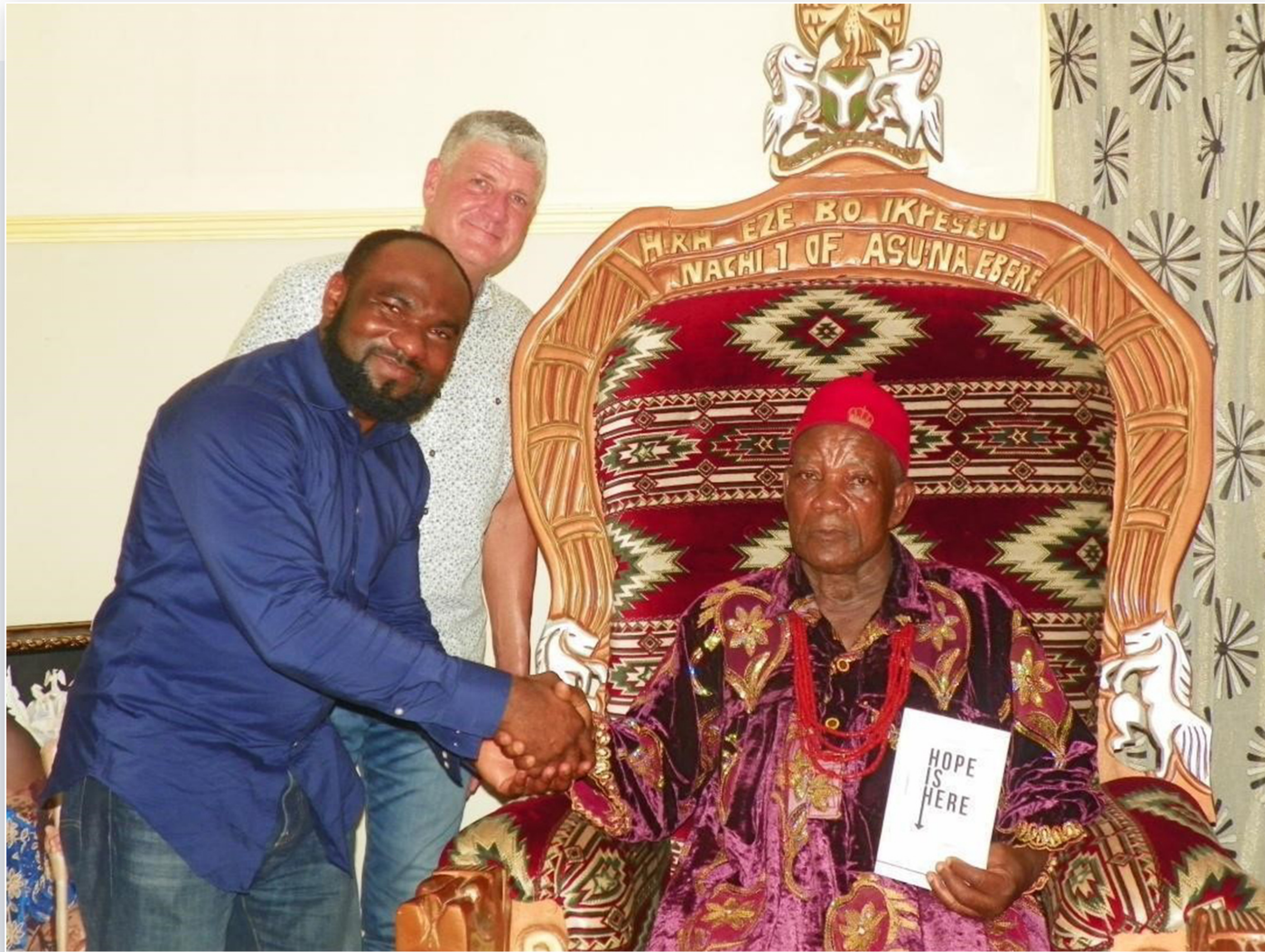
LoveGod and Pastor Clay from the Barefoot Church visit the King of the community of Agu Na Ebere, in Imo State, Nigeria

LLEM International Inc. was founded in 2006 in the Nigerian city of Aba (population over 1 million), and was first incorporated in 2008. In 2014, LLEM International received incorporation in Sweden and in 2016, it received its incorporation in the U.S. Today, LLEM International is registered as a nonprofit in three countries with offices in the United States, Europe and Africa.