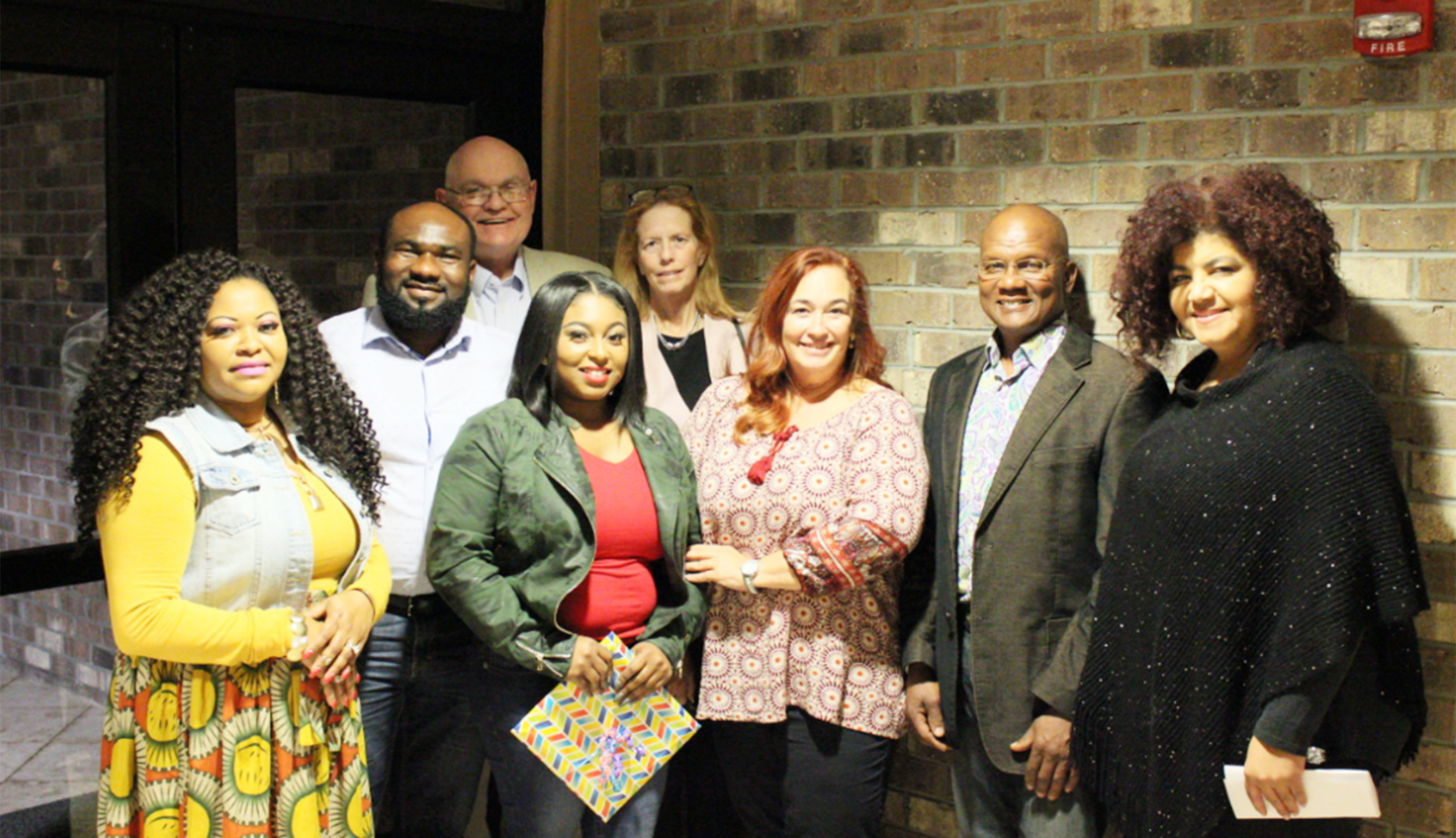
LLEM International advisory board members 2018