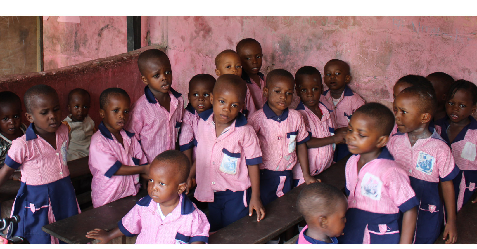
"Train up a child in the way he should go and when he is old, he will not depart from it" (Proverb. 22:6)

I thank God for the ability He has given us to be able to lead these children in a godly way, knowing that the greatest thing we can do for these children is to lay a solid foundation for them, a foundation laid on the Word of God.