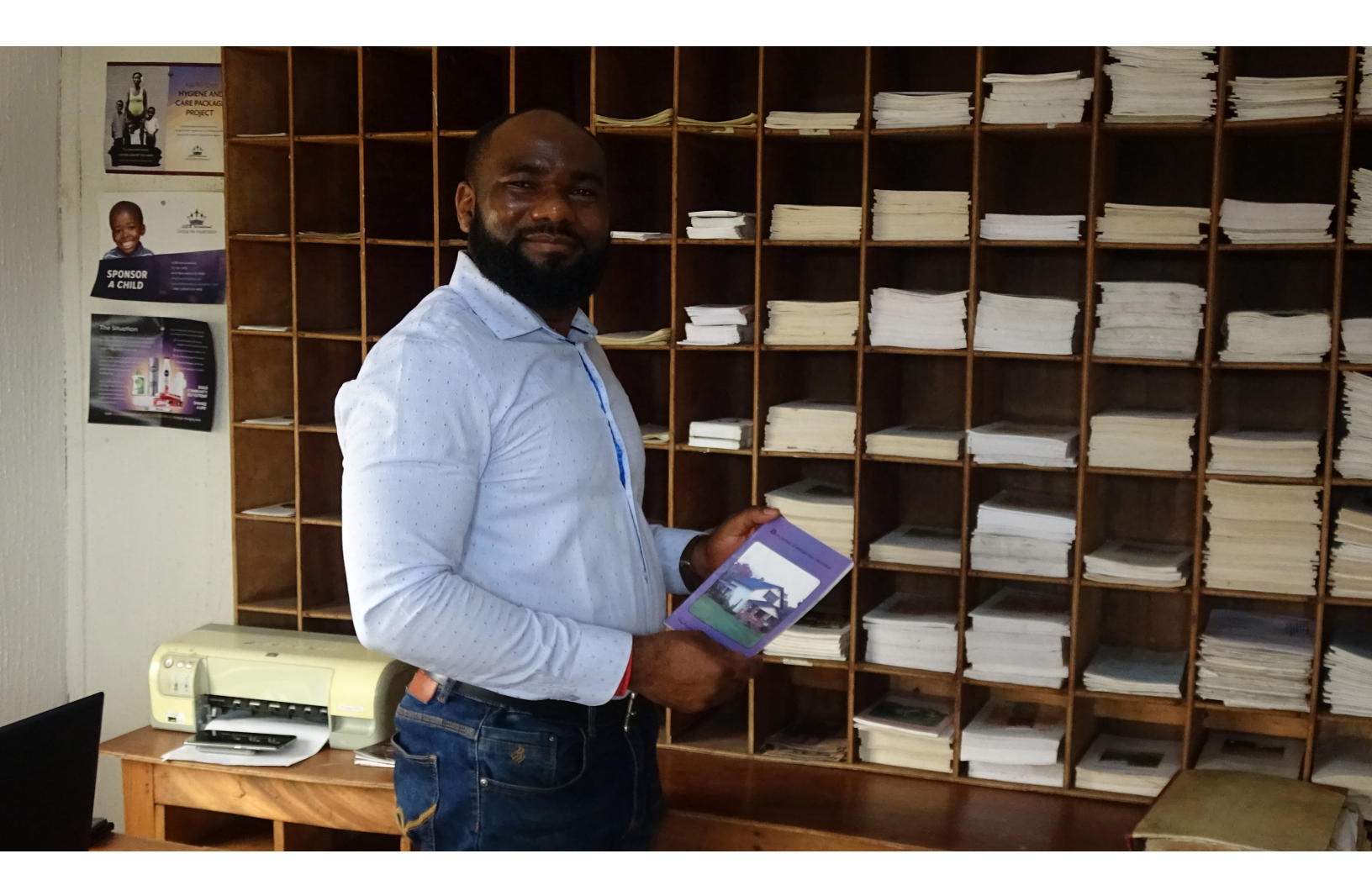
It's not about what we can do on our own, but it's about what we all can do together to reach the world in sharing love and in making a difference in people's lives.